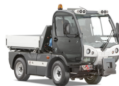
M200 (B200 with no brooms)